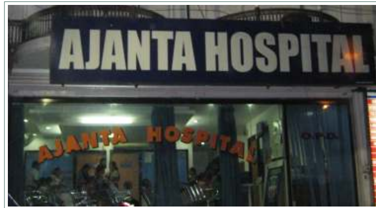
Ajanta Hospital and IVF Centre - Lucknow