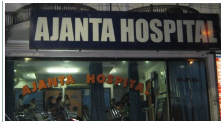
Ajanta Hospital and IVF Centre - Lucknow